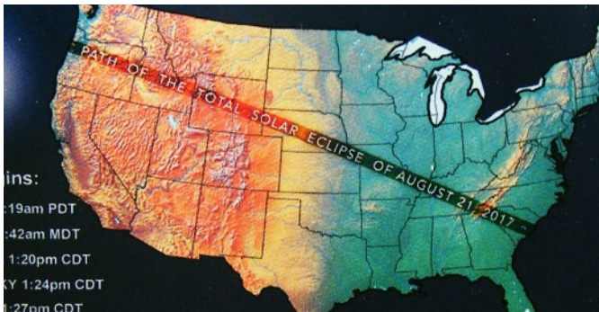
The eclipse path across the US