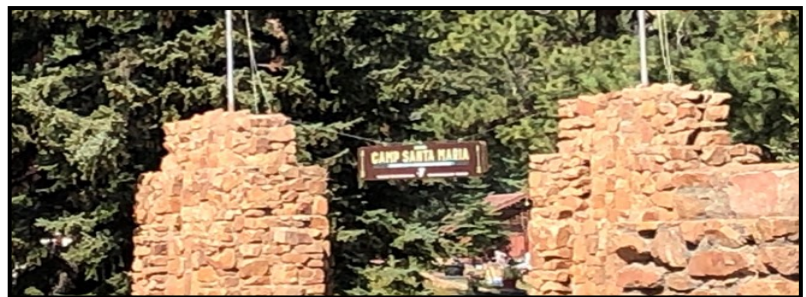
Camp Santa Maria

46. Former resort turned into Catholic summer camp